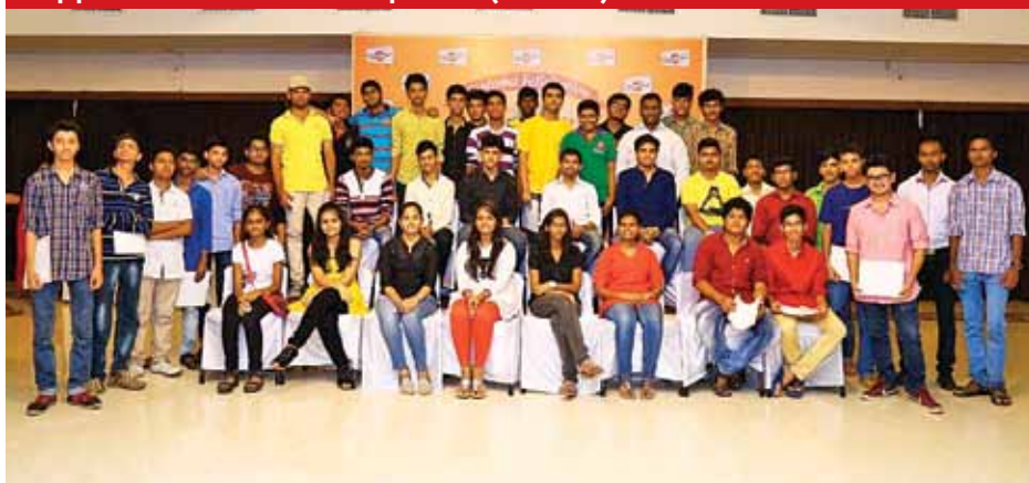
Toppers of Second Year Diploma (Sem III) Nov. '14 exams