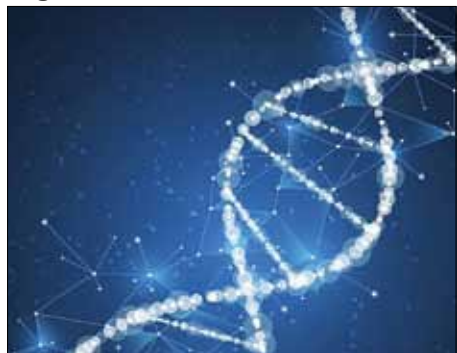
Fig.1 DNA Structure